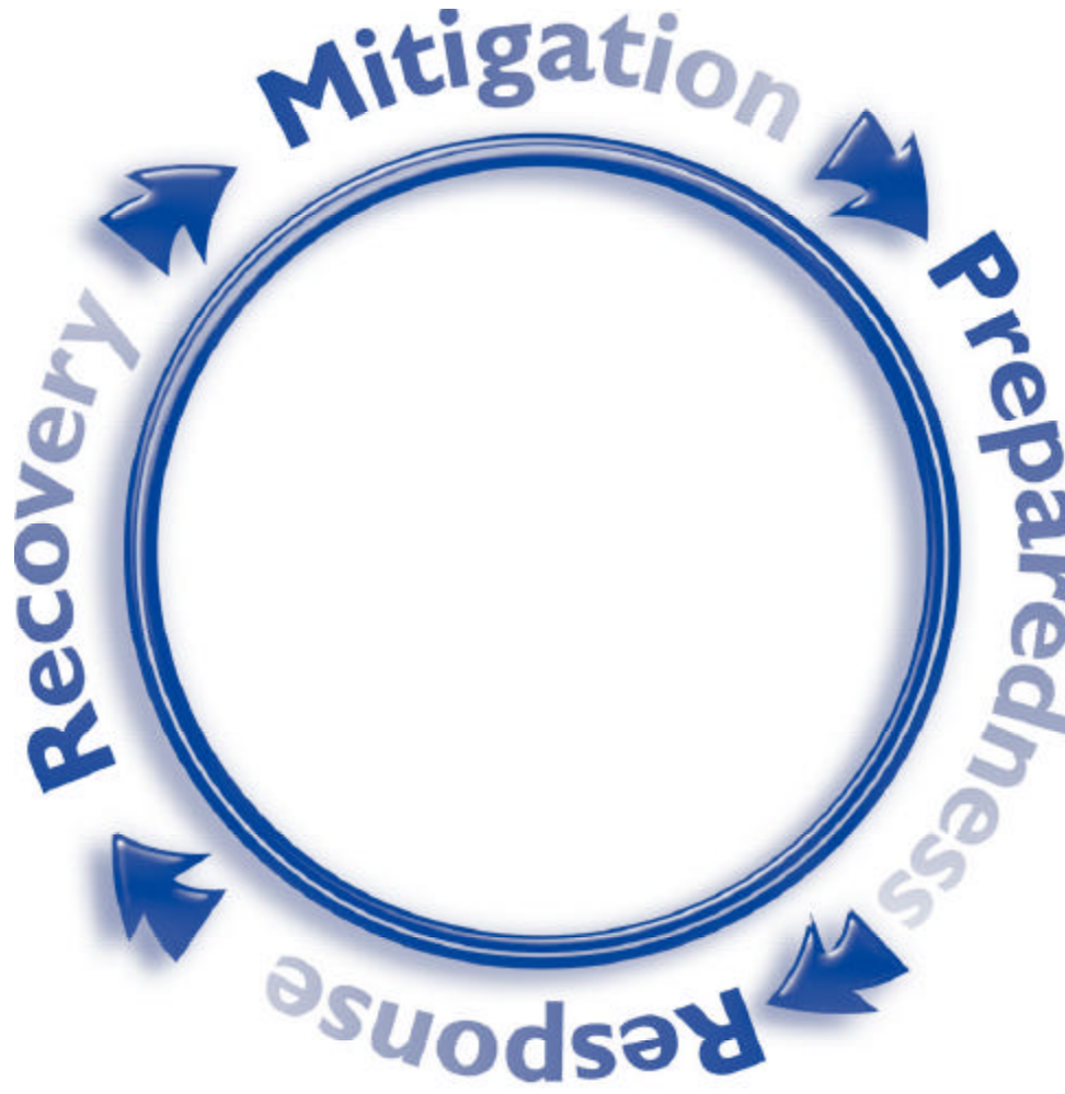
Exhibit 1.1 Cycle of Crisis Planning

Guide provides the resources needed to start the planning process and is a tool used to review and improve existing plans.