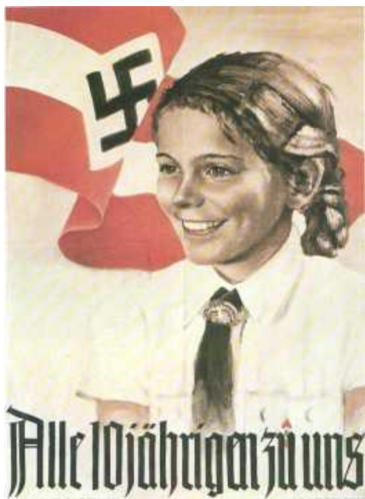
25. End WWII Era